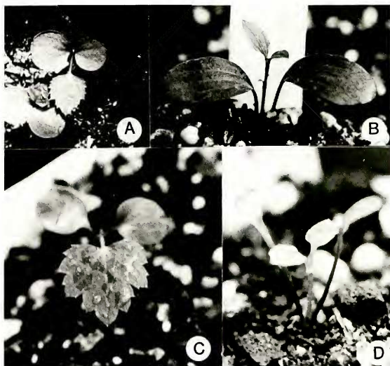
FIG. 1. Seedling types. A. Type I seedling of Clematis beraclefolia DC. B. Type II seedling of Clematis crispa L. C. Type I seedling of Clematis catesbyana Pursh. D. Type II seedling of Clematis terniflora DC.